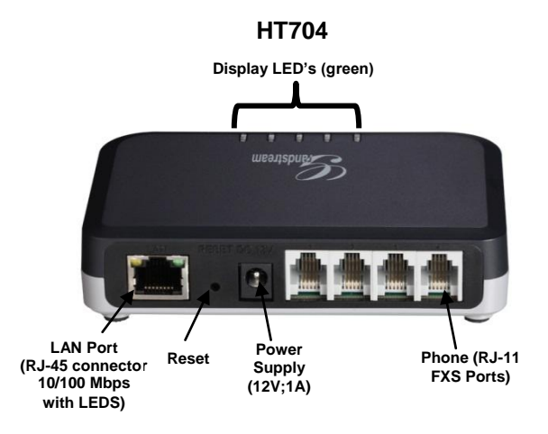
FIGURE 1: DIAGRAM OF HT70X